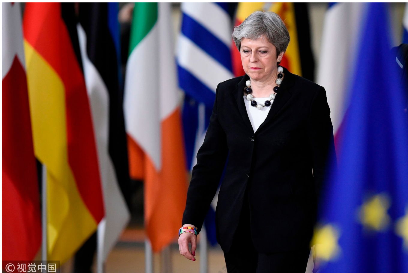
Britain's Prime Minister Theresa May arrives at the European Council headquarters on the second day of a summit of European Union (EU) leaders on March 23, 2018, in Brussels.